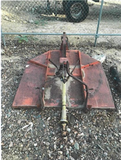
RK60A Rotary Mower Attachment.