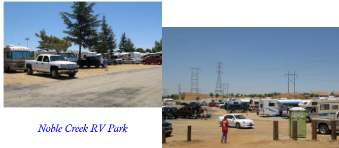
Noble Creek RV Park

On site parking - 280 paved parking stalls, 20 handicap additional auxiliary parking - approx. 300 stalls