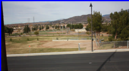
Noble Creek Ball Field #7