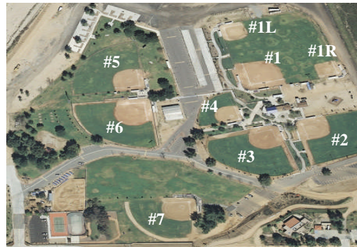
Noble Creek Ball Fields 1—6