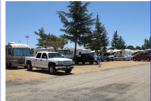
Noble Creek RV Park

Noble Creek Regional Park 650 W. Oak Valley Parkway Beaumont, CA 92223 Tel: 951-845-9555 Fax: 951-845-9557 www.bcvparks.com